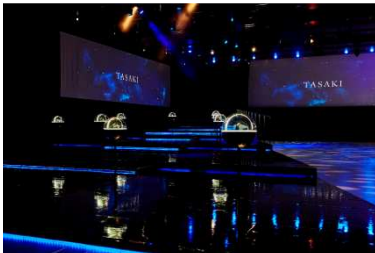
The venue image which "TASAKI TIMEPIECES" was displayed

TASAKI hopes you will enjoy the modern and sophisticated world of high jeweller TASAKI with the launch of its luxury watch collection, "TASAKI TIMEPIECES" and latest jewellery collection, "Curiosity".